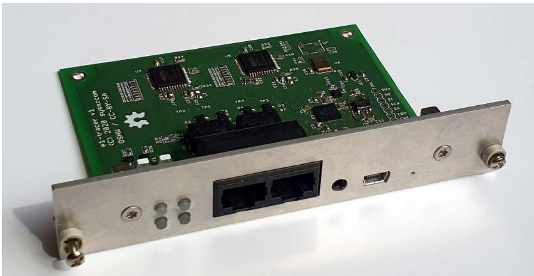
Figure 1: e1-tracer BGT variant

The e1-tracer Hardware consists of a single circuit board, mechanically either assembled into a desktop enclosure (KOH variant) or into a 3U component carrier module (BGT variant).