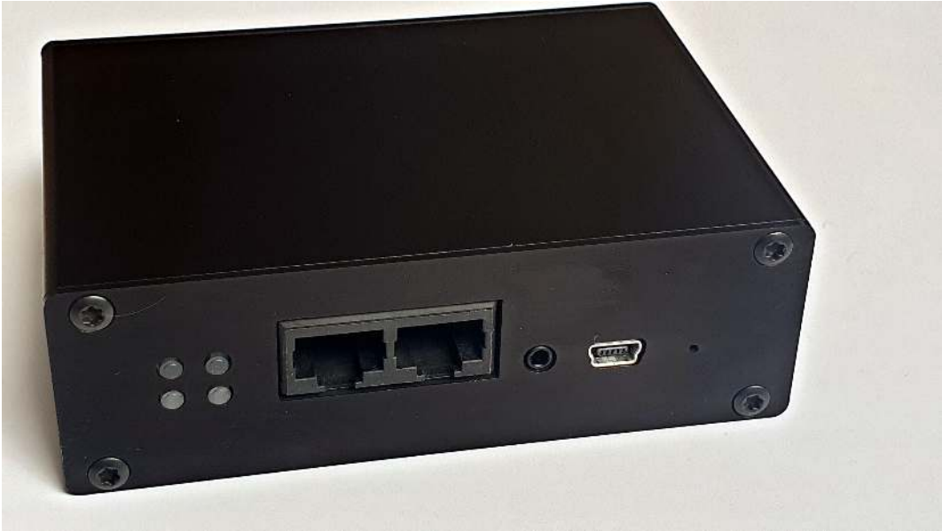
Figure 2: e1-tracer KOH variant